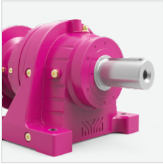
R..01 Solid output shaft