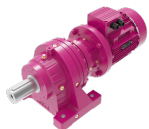
RV.L Series with IEC B5, C26 or M46