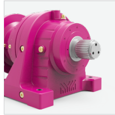
R..1K/1L Solid output shaft with splines

Please see Options and Accessories additional information