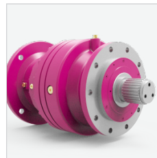
P..1K/1L Solid output shaft with splines