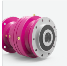
P..0K/0L Hollow output shaft with splines