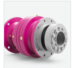
P..0S With shrink disk

Please see Options and Accessories additional information